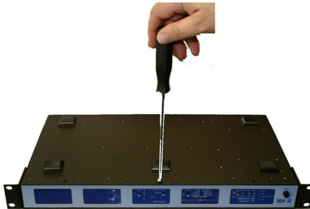
Figures 1 and 2